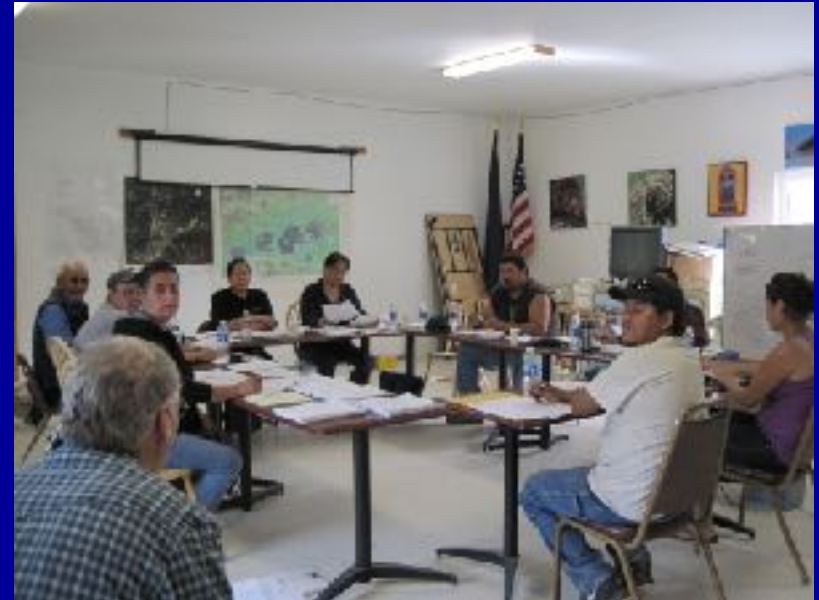
Meeting with the Fort Yukon Tribal Council in July 2009.