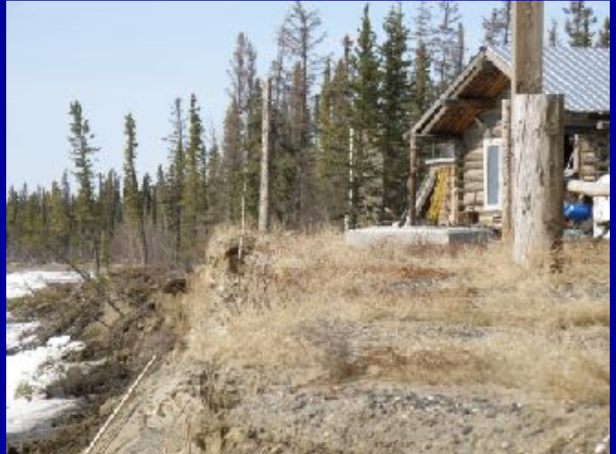
Erosion in front of Clarence Alexander's house