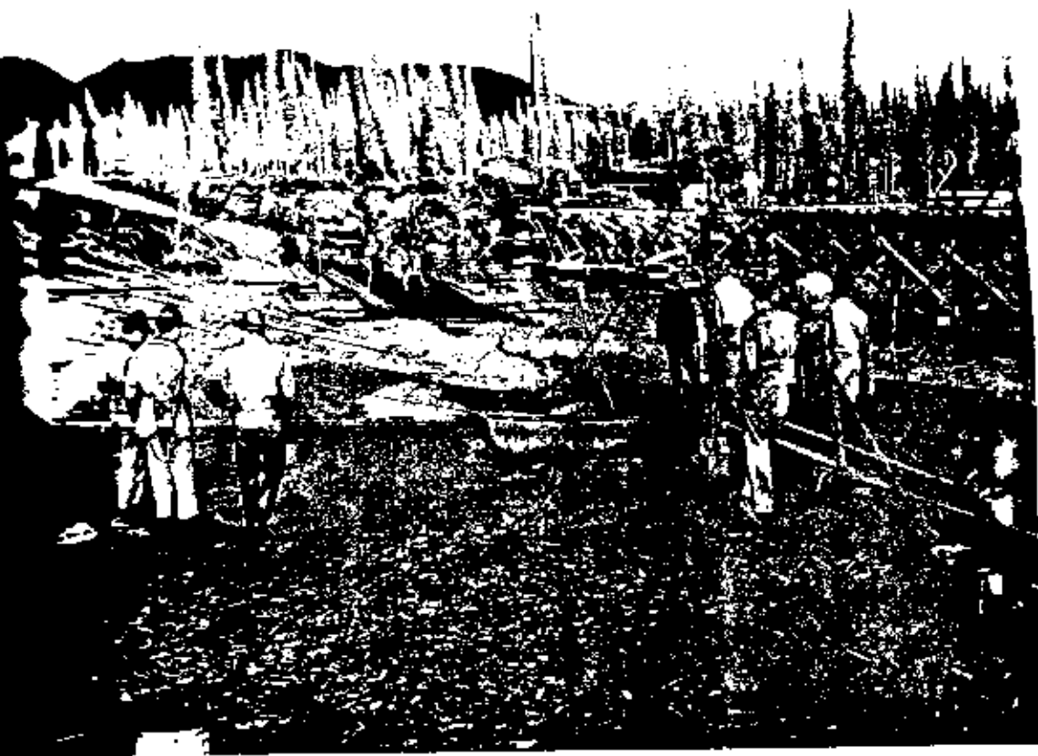
Donjek River Bridges (1942)